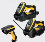
Tethered / Cordless Models via cradle and Bluetooth